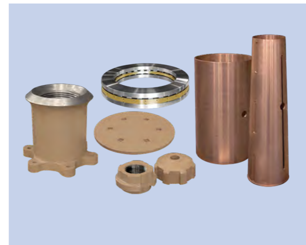
Telsmith® cone crushers