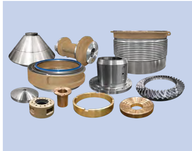
MP® cone crushers