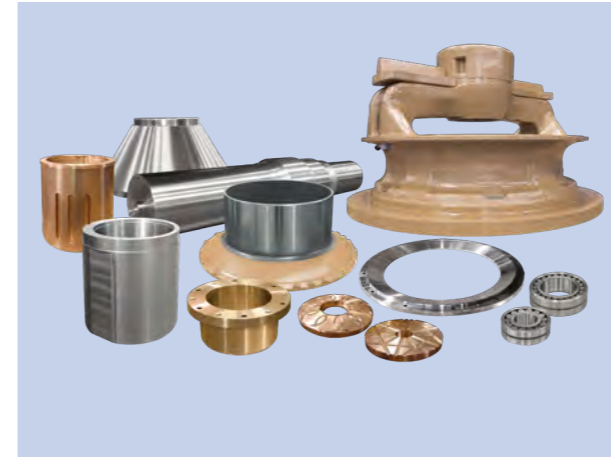
Omnicone® cone crushers