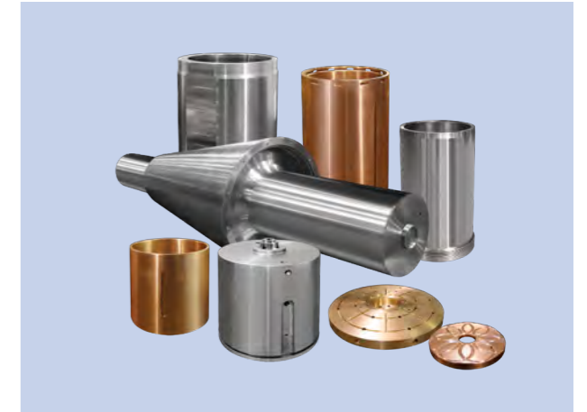
Gyrotory crusher brands we support: