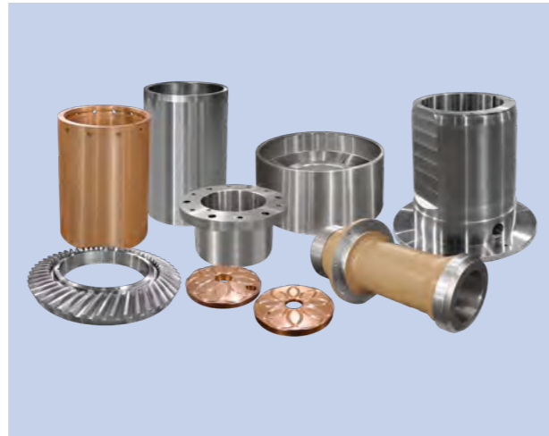
Allis-Chalmers® cone crushers