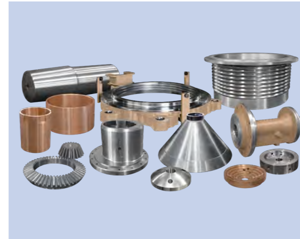
Sandvik® cone crushers