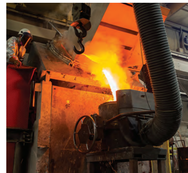
Standard bronze pour from furnace to ladle in our foundry for EXCEL™ parts, located in Pekin, Illinois, USA

We begin preparing for casting by selecting the highest grade pure raw materials. The unique centrifugal casting technique that we use produces a tighter, denser grain structure in the alloy and eliminates nearly all gas pockets. What does this mean to you? The cast alloys you buy from us last longer and have significantly fewer defects.