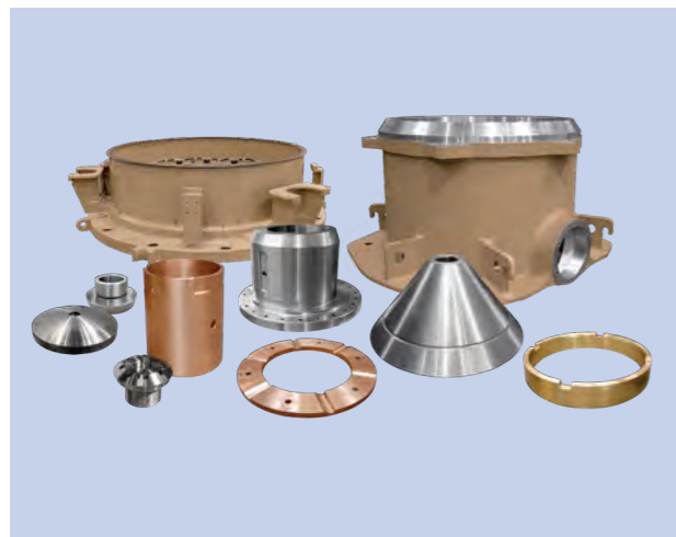
HP® cone crushers