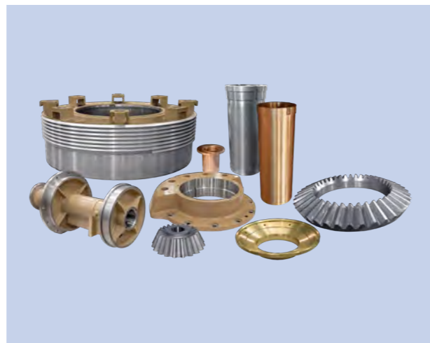
Symons® cone crushers